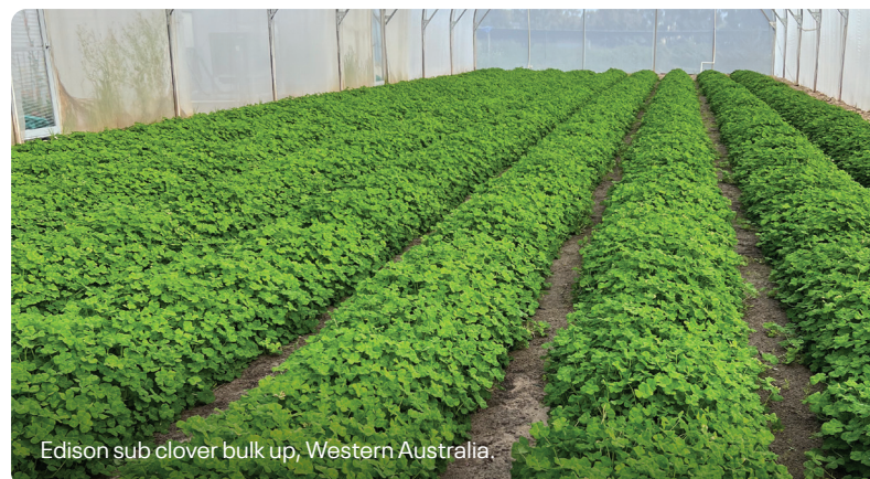
Edison sub clover bulk up, Western Australia.